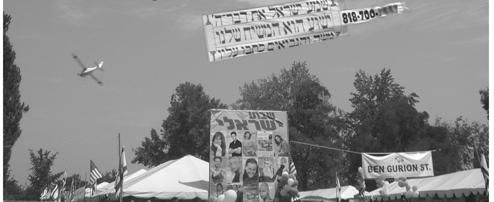
Hebrew-Christian missionaries hired an airplane to pull a huge banner with a proselytizing message in Hebrew over the annual Israeli Festival in Woodley Park, CA.