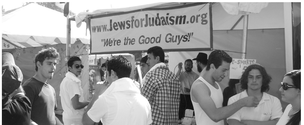
MISSIONARY BANNER BACKFIRES!

Ironically, this banner created a phenomenal interest in our Jews for Judaism booth and the upcoming programs that our Los Angeles branch was launching. As a result, Jews for Judaism staff are now in touch with several people who expressed an interest in refuting missionary claims and in learning more about Judaism. ■